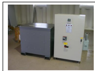
200KVA Varmatic VoltageMaster